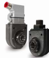
Avtron HS35M with fully protected 4125 5-15V high-power outputs

When selecting an encoder, specify high-power line drivers, such as the 4469 and 4125 or dedicated discrete component designs. Or for shorter runs, be sure to select a fully rated 7272 to replace open collector designs wherever possible. These high power output versions can replace their weaker cousins with no wiring changes.