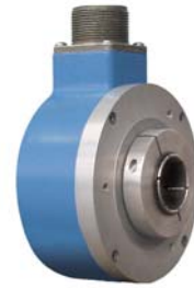
Avtron HS35A with fully protected 5-24V fully rated 7272 driver

Select encoders with fully short-circuit protected outputs: Some models' outputs cannot be connected to ground, others to +V, and some fail if outputs are cross-connected. Ensure your encoder provides "transient protection" so that external surges don't destroy outputs. Use a high quality, individually pair shielded signal cable to keep noise out.