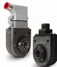
Avtron HS35M Magnetic Encoder

Avtron has created the HS35M, a small, low-cost magnetic hollow shaft encoder for motor or shaft mounting. This product addresses each of the failure modes in existing small optical and magnetic encoders.